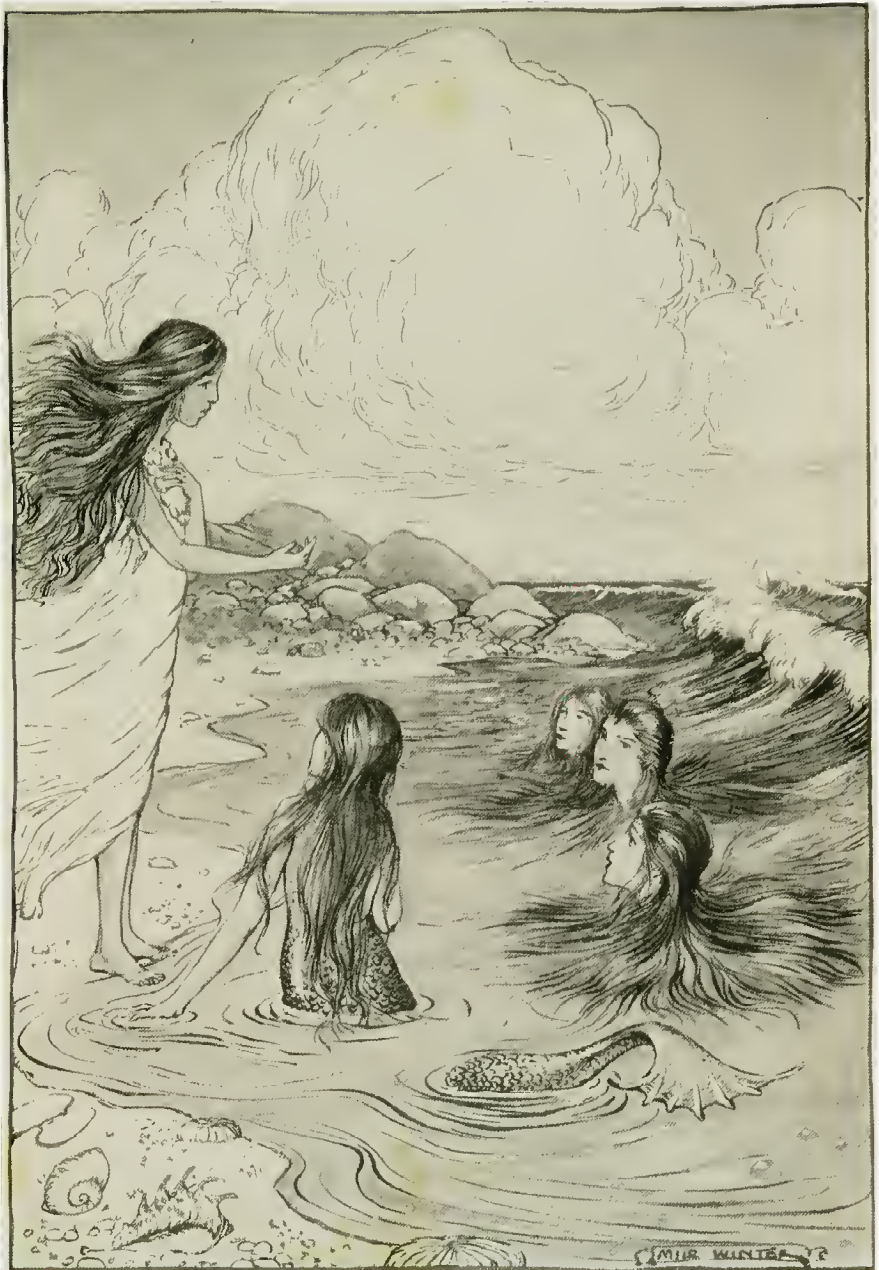
The child besought them to go with her a little way into the fields